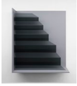
Elizabeth Orr Farmer, 2017 Tinted Glass, aluminum, wood 57 x 50.5 x 12.5 in (144.8 x 128.3 x 31.8 cm) EO010