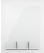
Elizabeth Orr Hunter, 2017 Glass, aluminum, wood 66 x 50 x 6 in (167.6 x 127 x 15.2 cm) EO011