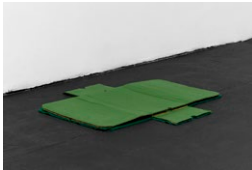
Elizabeth Orr A Free Economy Farmed and Hunted, 2017 Cardboard, felt 20 x 25 x 0.5 in (50.8 x 63.5 x 1.3 cm) EO013