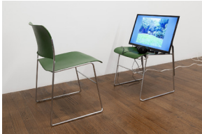
D'Ette Nogle St. Luke in the Fields, New York , 2024 Two local parish chairs, monitor, media player, headphones, digital video (color, duration 3 min 11 sec) 31 x 58 x 26 in (78.7 x 147.3 x 66 cm) The artist and Derosia would like to thank St. Luke in the Fields for the loan of two parish chairs.