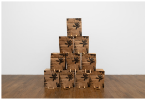
D'Ette Nogle Looks Like You Made It , 2024 10 Erewhon paper shopping bags 56 x 47 x 9 in (142.2 x 119.4 x 22.9 cm)