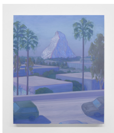
Witt Fetter Anaheim (Matterhorn) , 2025 Oil on canvas 30 x 25 in (76.2 x 63.5 cm) WF027 $6,000