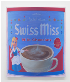
Witt Fetter Swiss Miss , 2025 Oil on canvas 72 x 60 in (182.9 x 152.4 cm) WF025 $15,000