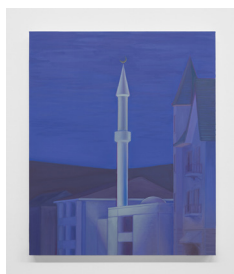
Witt Fetter Zurich (Mahmood Mosque) , 2025 Oil on canvas 30 x 25 in (76.2 x 63.5 cm) WF026 $6,000