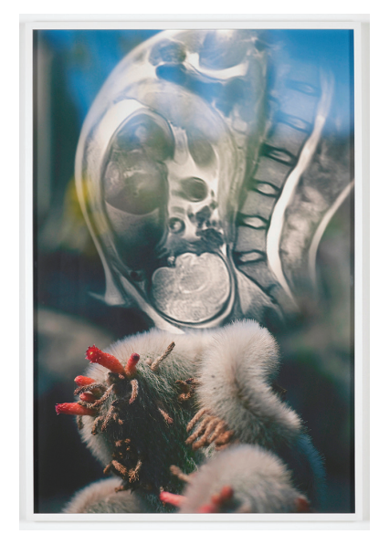
Josephine Pryde, "It's Not My Body I," (2011). Glicée print, 24 \times 35.5 ".