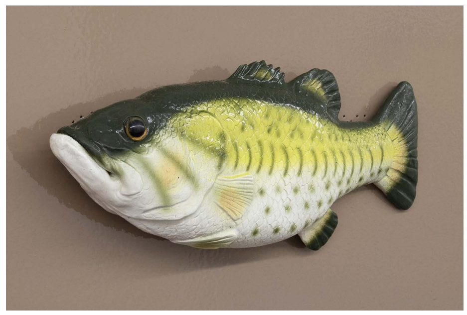
Dena Yago, Trawler (detail), 2020. Audio, wood, enamel, Big Mouth Billy Bass, 30 x 27 1/2 x 5 1/2 in.