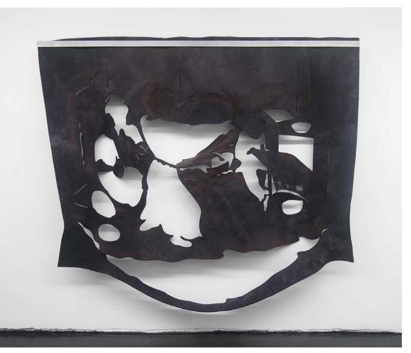
Dena Yago, The Grain Sifters, 2017, pressed wool, natural dyes, steel, 73 x 85 x 6 in.