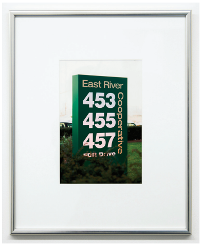
Patrick Armstrong, "East River Cooperative (453, 455, 457 FDR Drive)," (2014). Inkjet print, 16.25 × 20".

Suspended above the floorbound works, three interconnected sculptures by Yago hang from the ceiling to form an extended metal chain