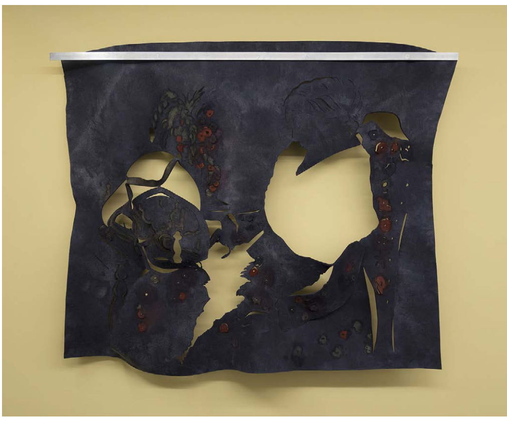
Dena Yago's "Sleeping Spinner" in felt. Courtesy of the artist and Bodega