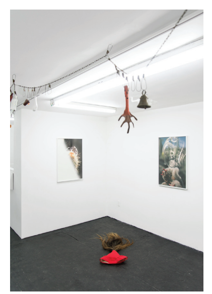
Lands' End, installation view.

The domestic comprises the text's remaining themes, with short segments authored in the first-person by Armstrong, Goyette, and Latta, as well as Yago. Each offers short musings on the apartments they have shared together in a variety of cosmopolitan centers, such as Berlin and Los Angeles. The tone—nostalgic, verging on the cathartic—tethers the show's often-abstract thematic content to a nexus of highly personal relationships and experiences. This particular brand of sincerity mirrors that of the exhibition as a whole, in which critique is catalyzed not