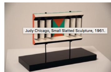
11 Judy Chicago, Small Slatted Sculpture , 1961.