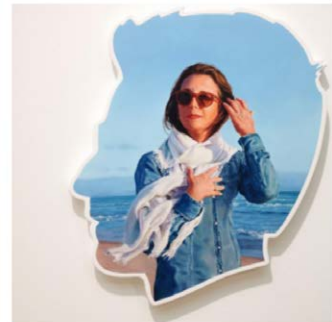
9 Alex Israel, Self-portrait mom , 2016. Acrylic and bondo on fibreglass, 243.8 x 213.4 x 10.2 cm.