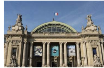
1 Exterior view of FIAC at the Grand Palais, Paris, 2016.